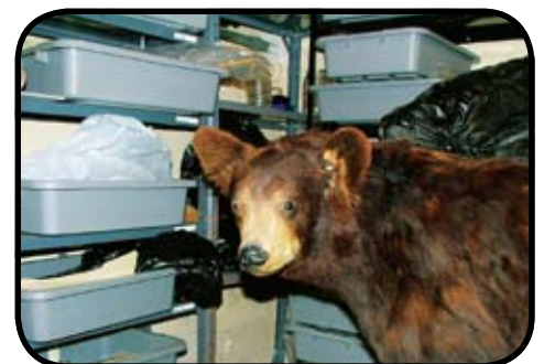
In the Lab, Tilly stands guard over bins of bagged birds and other artifacts.

Under the watchful eye of our collection manager, Beth O'Toole, myself along with an excellent group of volunteers, started the task of deaccessioning and disposition. We needed space in our main collection room to properly store the zoological portion of our natural history collection, and objects from our anthropological collection, especially the Native American portion, of which many pieces are very fragile.