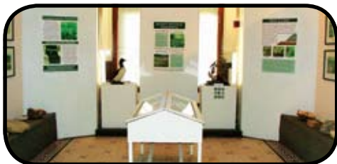
Pictures and text help explain these two unique habitats here in Elgin.

Elgin's Natural Treasures Trout Park and Bluff Spring Fen