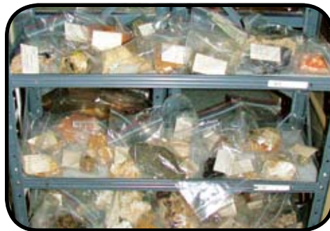
Shelves of rocks and mineral are very forgiving of their environmental home.