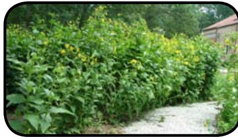
Cup Plants seven feet tall

Three years ago this spring, the City of Elgin converted the area just west of the Museum into a teaching garden with native plants, paths and seating assisted by a group of volunteers from Comcast. Although they planted over a hundred plants and several trees, the plot looked pretty sparse that first summer. What a difference a year makes. Last summer and this summer we had a virtual jungle out there. The great thing about the species of plants used is that they were all native. Our unpredictable weather conditions here in Elgin are no problem for these plants. In rain or drought, heat or cool weather, they seem to thrive.