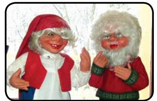
The Nisse from Norway always have a treat at the holiday season. Do you know what is?

After what seemed like a lifetime, the tradition of displaying Touching on Traditions at the Lords Park Pavilion came to an end last year. There was some apprehension on our part when we decided to make the change. Many challenges that had to be overcome. First the museum wasn't as large as the Pavilion and some displays had to be eliminated. Accommodating school classes was also a concern. With a diagram of the floor space, tape measure and knowledge of the displays, our master planner, Sara Russell got to work. Of the 62 countries we had available about a dozen had to stay in storage. Concentrating on regions of the world and different cultures, a floor plan was finalized which allowed a smooth flow of 2 simultaneous classes enjoying the stories from around the world.