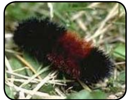
Woolly Bear Caterpillar

So, if you missed Summer, Fall is upon us – followed by winter and followed again with a Spring Awakening. Get Outside – away from houses, cars, microwaves, electronic games, cellphones, school and work and explore your world. Put on a new set of glasses and also hear, touch and smell the wonders you have been missing. Please accept an invitation to explore outside and enjoy!